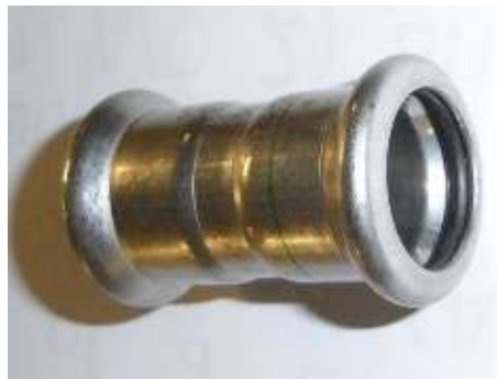
Fig. 1 Fitting before installation (EPDM)