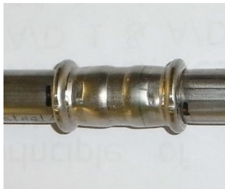
Fig.3 Pressed Fitting