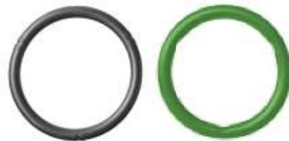
Fig. 2 EPDM and Viton O-Rings